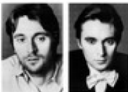
FRANCESCO BY FRANCESCO: BEFORE & AFTER*

Francesco Vezzoli was born in 1971, in Brescia, Italy. He studied at the Central St. Martin's School of Art in London. He currently lives and works in Milan. He is one of the most successful Italian